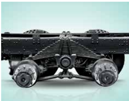
Highly Robust suspension options – mechanical with parabolic or semi elliptical leaf springs