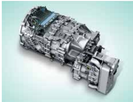
Eurotronic Automated transmissions for comfortable and safer driving