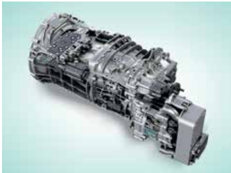
The innovative manual 16-speed ZF Ecosplit 4, equipped with a servo shift system