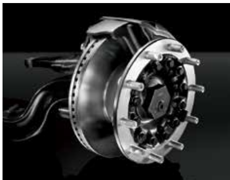
ABS & EBL Systems for efficient braking